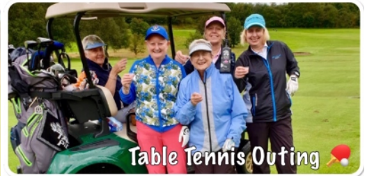
Table Tennis Outing