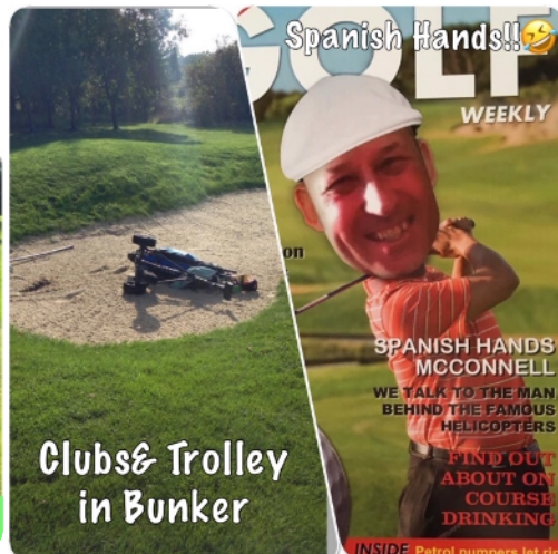
Clubs & Trolley in Bunker